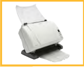
Kodak i1200 Series Scanners

Smart Touch functionality is built into all of these Kodak Scanners—