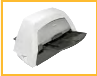
Kodak i1400 Series Scanners