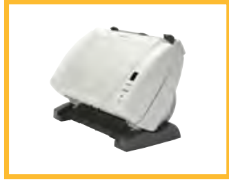
Kodak i1300 Series Scanners